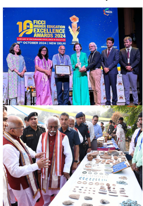
PROMINENT MOU'S AT NATIONAL AND INTERNATIONAL LEVEL

CUH emphasizes high-quality research, fostering a research-driven ecosystem that supports innovations across various domains. The University houses several research centers and laboratories equipped with modern facilities, funded through national and international grants. Research and innovation activities are closely aligned with industry trends, and the University promotes entrepreneurship through its Start-up Cell and Innovation Hub. The University has also outlined its own Research and Innovation Policy to ensure the development of a strong academic and innovation ecosystem.